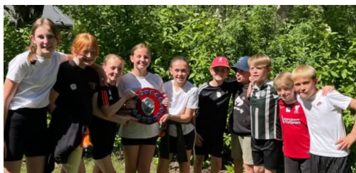
Some of our fantastic Y6 at Quad Kids on Wednesday at the Community School