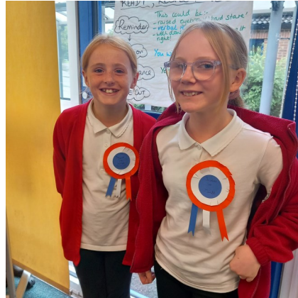
Celebrating Bastille Day