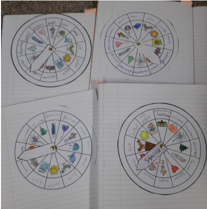
Learning the months of the year