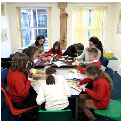
Ukrainian Christmas Crafts