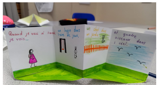
Making mini-books about animals we see on the way to school