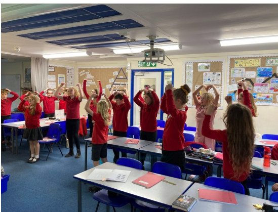
Singing the days of the week, YMCA-style

Y6 prepared for moving to secondary school by using their language detective skills to solve puzzles in French, Spanish and German.