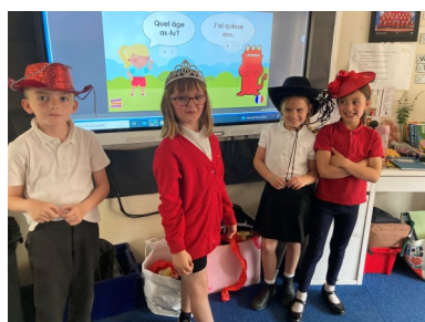
Dressing up for role plays to practise introducing yourself.