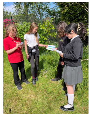
Y6 using their 'Language Detective' and orienteering skills to solve puzzles in French, Spanish, German (and some other languages) in preparation for their transition to Y7.