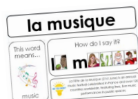
Words of the Week and French Speakers of the Month (from both near and far).