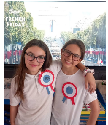
Learning about French national holidays, like Epiphany and Bastille Day.