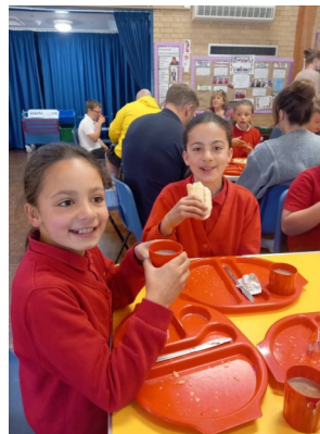
Croissants and baguettes to start the day - our fabulous catering team have again provided French breakfasts for our children and their parents & carers.