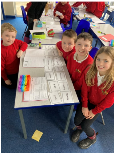
Team matching activities in Y3 to learn the days of the week.